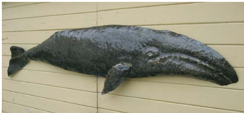
Whale Art - Metal sculpture by local artist, Ed

Fantasy Landscape - This is the perfect gift for a new home owner! Give the gift of a gracious garden to yourself or someone in your family. Package includes 50 1-gallon garden plants from Suncrest Nurseries and 3 hours of landscape design by Lynn Robinson Designs.